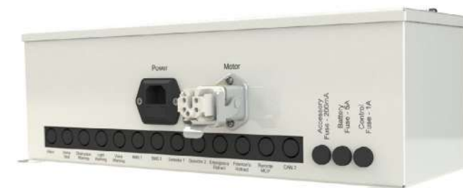
MK5 CONTROL BOX