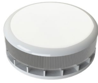
31022 - Light and Sound Warning - (LSW)