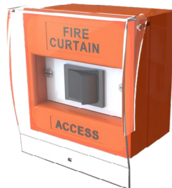
29187 - Emergency Access Button (push and hold action for emergency services)