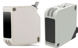
29188 - Obstruction Warning System (OWS) - <60m