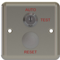
34101 Test Reset Switch - (TRS)

Provides localized testing of the associated curtain(s) remotely from the control panel location.