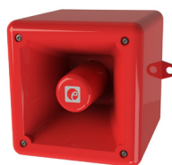
29085 - Voice Warning - (VWC)