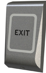
31019 - Emergency Egress Button Deluxe