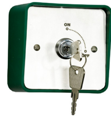
CF001434 - Standard Key Switch - Green