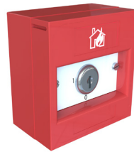
787-3105 - Standard Key Switch