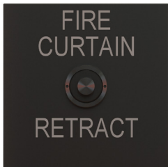
29186 - Emergency Egress Button Bronze