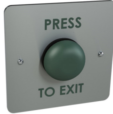
29181 - Emergency Egress Button Dome