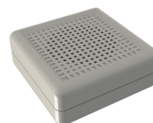
29086 - Voice Warning - (VWR)