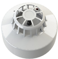
29035 - Heat Detector

Provides standalone activation signalling to the curtain.