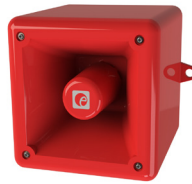
29085 - Voice Warning - (VWC)