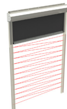
29175 - Obstruction Light Curtain (OLC) - <4m