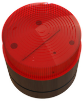
187-9653 - Light Warning - (LWC)

Designed for audio and visual signaling.