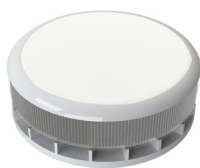
31022 - Light and Sound Warning - (LSW)