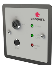
30078 Zone Control Panel Remote - (ZCP-R)