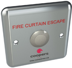
29197 - Emergency Egress Button R

Emergency Egress Buttons (ERB) provide egress through an already deployed Fire Curtain. The 'push and release' action of the ERB signals the Fire Curtain to retract and hold, before redeploying. This allows occupants to egress through the opening, before closing again after a set time period.