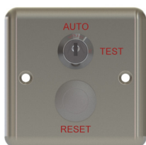
34101 Test Reset Switch - (TRS)

Provides localized testing of the associated curtain(s) remotely from the control panel location.