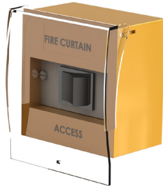
29187 - Emergency Access Button (push and hold action for emergency services)