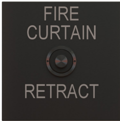
29186 - Emergency Egress Button Bronze