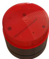
187-9653 - Light Warning - (LWC)

Designed for audio and visual signaling.