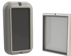
10517 Obstruction Warning System - (OWSR) - <5m