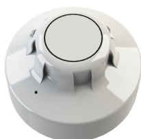
29003 - Optical Smoke Detector

For Optional Extra Datasheets please visit: www.coopersfire.com/resources/optional-extras