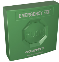
29174 - Emergency Egress Button Standard