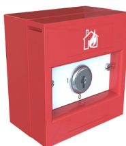
787-3105 - Standard Key Switch