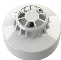
29035 - Heat Detector

Provides standalone activation signalling to the curtain.