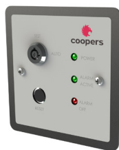
30078 Zone Control Panel Remote - (ZCP-R)