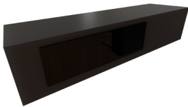
29190 - Obstruction Warning System - Vertical (OVS) - <3.5m

The Obstruction Warning System monitors the opening protected by a fire curtain to ensure it is kept clear. If the opening is obstructed the LED beam will be broken and then after a short delay period a warning device will be activated. The warning device will be audible and/or Visual.