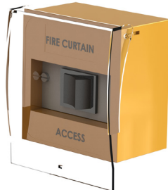
29187 - Emergency Access Button (push and hold action for emergency services)